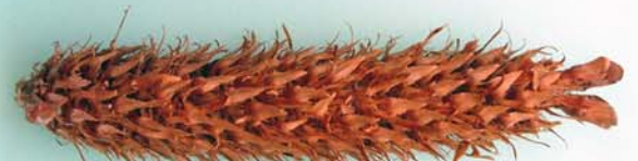
Sitka spruce squirreled