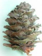
Larch full (left) squirreled (right)