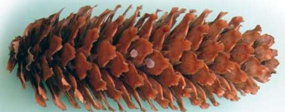
Sitka spruce full