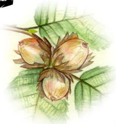
Hazel full (above) squirreled (below)