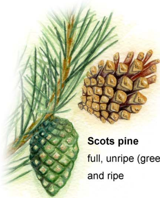
Scots pine full, unripe (green) and ripe